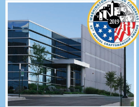
Building ACC10 is 130,000 square feet and opened in 2019. This building won the Washington Building Congress Craftsmanship Award, and was awarded LEED Gold Status.