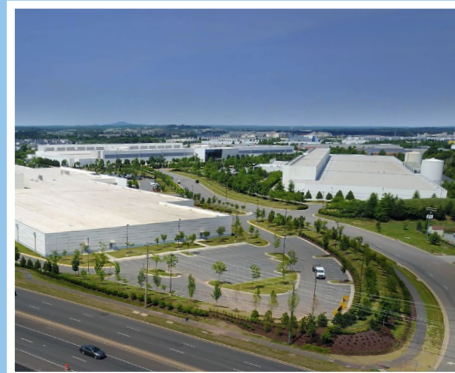
Overview of the Ashburn Corporate Center Complex.