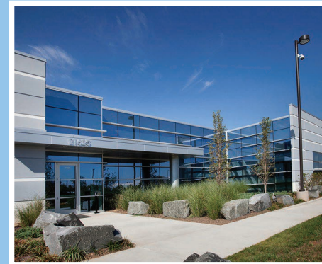
Building ACC7 is 446,000 square feet and the project was completed in 2014. ACC7 was awarded LEED Gold Status.