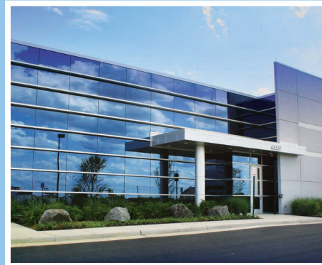
Building ACC6 is 300,000 square feet and the project was completed in 2014.