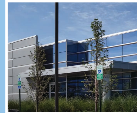
Building ACC9 is 180,000 square feet and was completed in 2017.